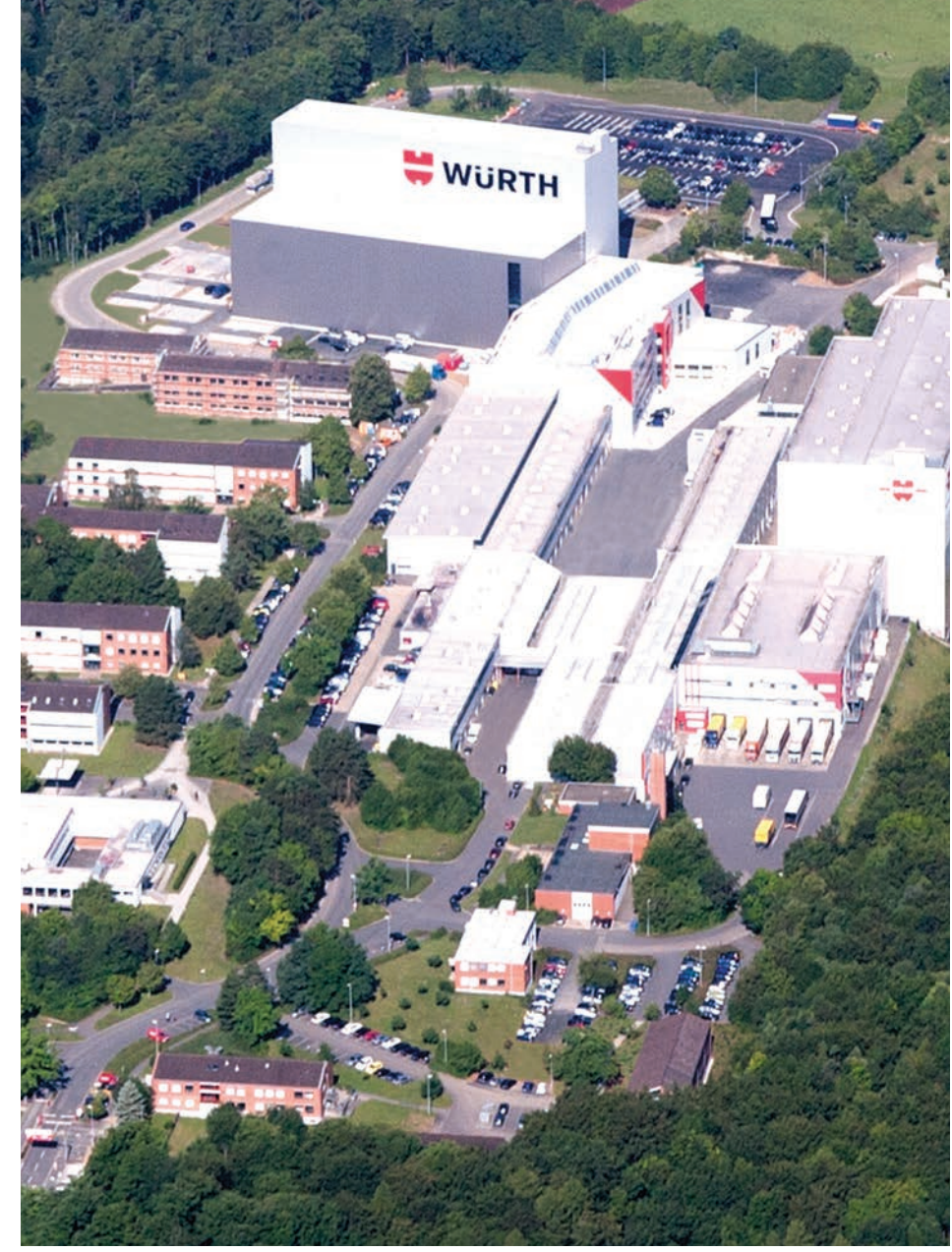
Most modern logistics center for industrial supply in Europe. Würth Industrie Service GmbH & Co. KG, Bad Mergentheim

On the one hand, it is about being a full-range provider of products and services. On the other, it is about creating maximum supply security for you. We bring customised logistical procurement and supply concepts directly to the production lines. We offer you scanner-supported racking systems, automated, electronic ordering systems or just-in-time supply using Kanban. However, our particular selling point is that we never cease in our quest to consistently develop as a reliable service