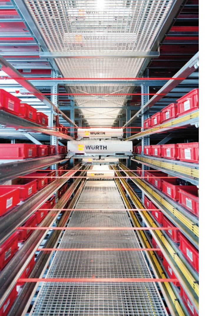
Ultra-modern technology: OSR (order storage and retrieval) shuttle warehouse